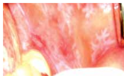
White lacy striations on buccal mucosa