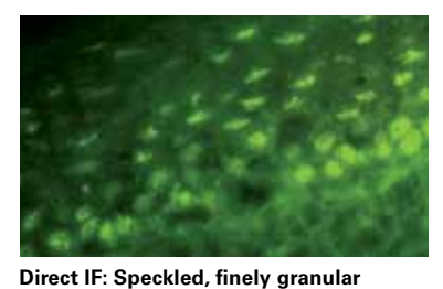
pattern of immunoglobulin G (IgG) deposition in the nuclei of keratinocytes